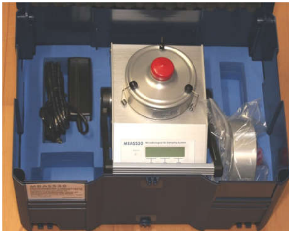
Figure 1: Parts for shipping prior to padding