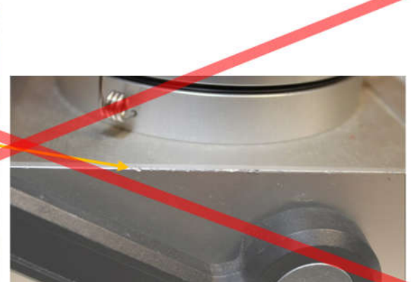
Figure 4: unnecessary damage of the side panel caused by missing padding during transport