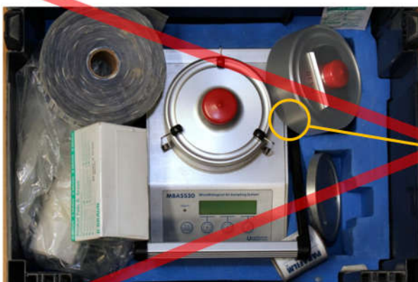
Figure 3: Situation as delivered without padding and with unnecessary accessories